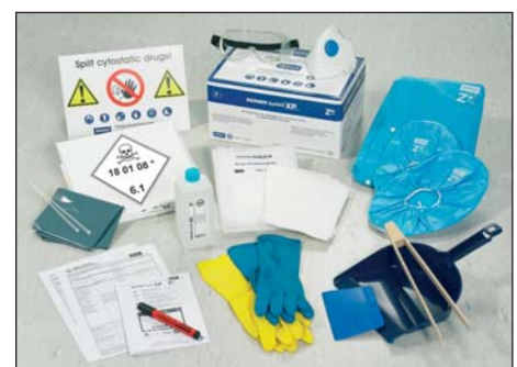
The contents of BERNER SpillKit Extra XP Protection comply with QuapoS3 [Quality Standards of the Oncology Pharmacy Service].

BERNER SpillKit Extra XP Protection comes in two different sizes and has everything you need for dealing with any kind of accident. With its particularly large scoop, sweeper, tongs, distilled water, highly absorbent ChemoSorb pad and tearproof ISYSOFT cloths, you are perfectly equipped to deal with contamination in both liquid and powder form and broken glass. Its clever design and comprehensive documentation ensure that it is used correctly, and the 10-point operating instructions in picture form, which are universally understood, make it particularly user-friendly and safe.